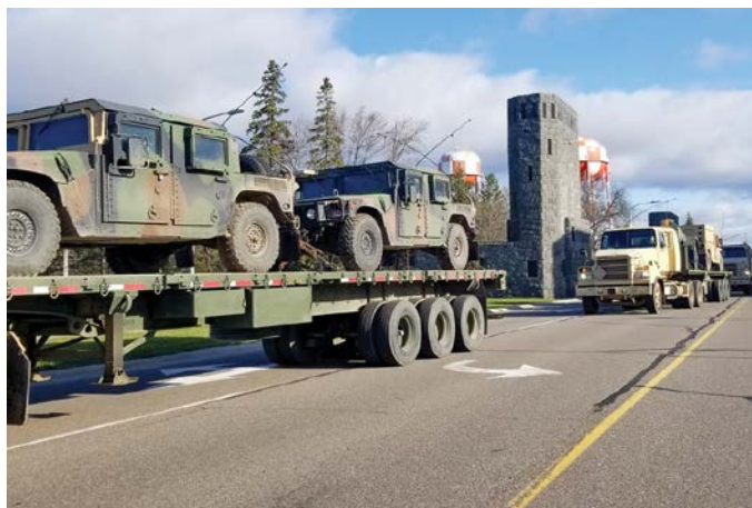
Members of the Minnesota Army national Guard conduct convoy operations at Camp Ripley at the height of summer in 2024.

Credit (The Military Review, November 2024)