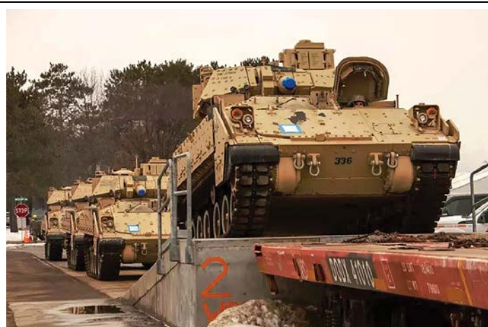
Minnesota Army National Guard armored vehicles are loaded to a coastal port point of departure to support a 9-month deployment in 2021

Currently the entirety of 34ID, as operationally aligned, is comprised of nine brigades, forty-six battalions, and 240 companies that span across twenty-nine states. 34ID consists of over twenty-seven thousand soldiers and over seven thousand pieces of prime moving equipment.